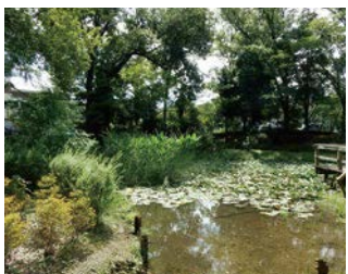
Aquatic botanical garden

In the areas of the river where there is abundant sunshine, wild primroses have been growing. Now, many wild plants are extinct due to river diversion and riverside protection construction. In order to protect these endangered species, a 1600m 2 nursery is reserved to cultivate these plants at a corner of the park. In spring, the nursery is open to the public (only during the flowering period). Aquatic Botanical Garden