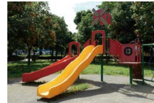
Little child Square