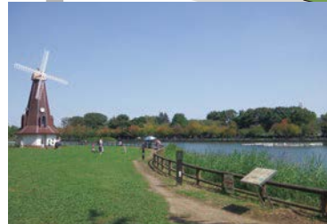
Windmill and Ukimagahara pond