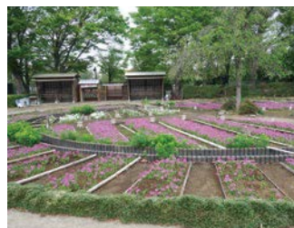
Ukimagahara Primrose Nursery Field