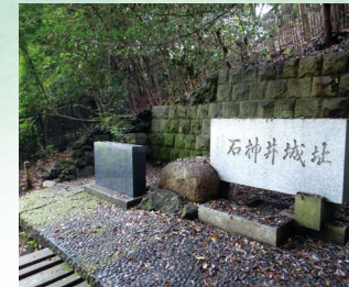
Ruins of Shakujii Castle