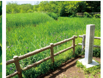
Sanpoji Pond Marsh plant colonies