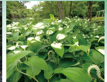
Hange-shou Asian lizard's tail