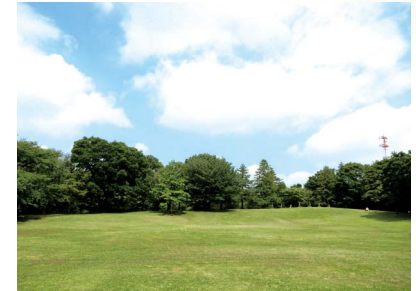
Hidamari (Sunny) field