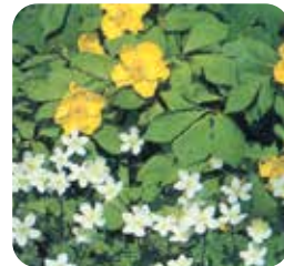
Soft windflower and hylomecon