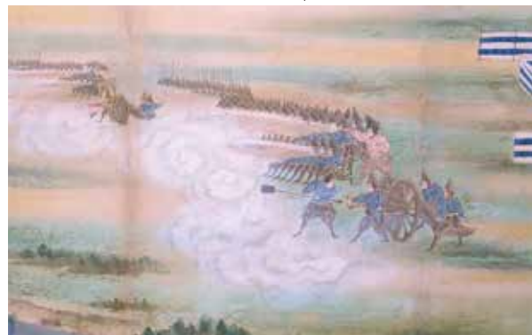
Owned by the Itabashi Historical Museum

At the end of the Edo Period, when the U.S., England, and Russia requested trade with Japan, the isolation policy of the shogunate government came under threat by the military powers of Europe and the U.S., where modern industrialization had been ongoing after the Industrial Revolution. In 1814, Shuhan Takashima began working as Nagasaki machidoshiyori-minarai in charge of Dejima-sonaeba, as of which time he learned gunnery from the Dutch. In 1840, he submitted a document entitled "Tempo Josho" to the shogunate government to explain the urgent need for Western gunnery. This was accepted and on May 9, 1841, for the first time in Japan, Shuho demonstrated ball-firing based on Western gunnery and deployment of horse and foot soldiers, proving the power of Western military skills and at the same time making himself famous. The area called Takashimadaira (Takashima hill) was named after Shuho Takashima. The Shogetsuin temple, which was used as the headquarters at the time of the gunnery demonstration, and the Itabashi Historical Museum (03-5998-0081) are adjacent to Akatsuka Park.